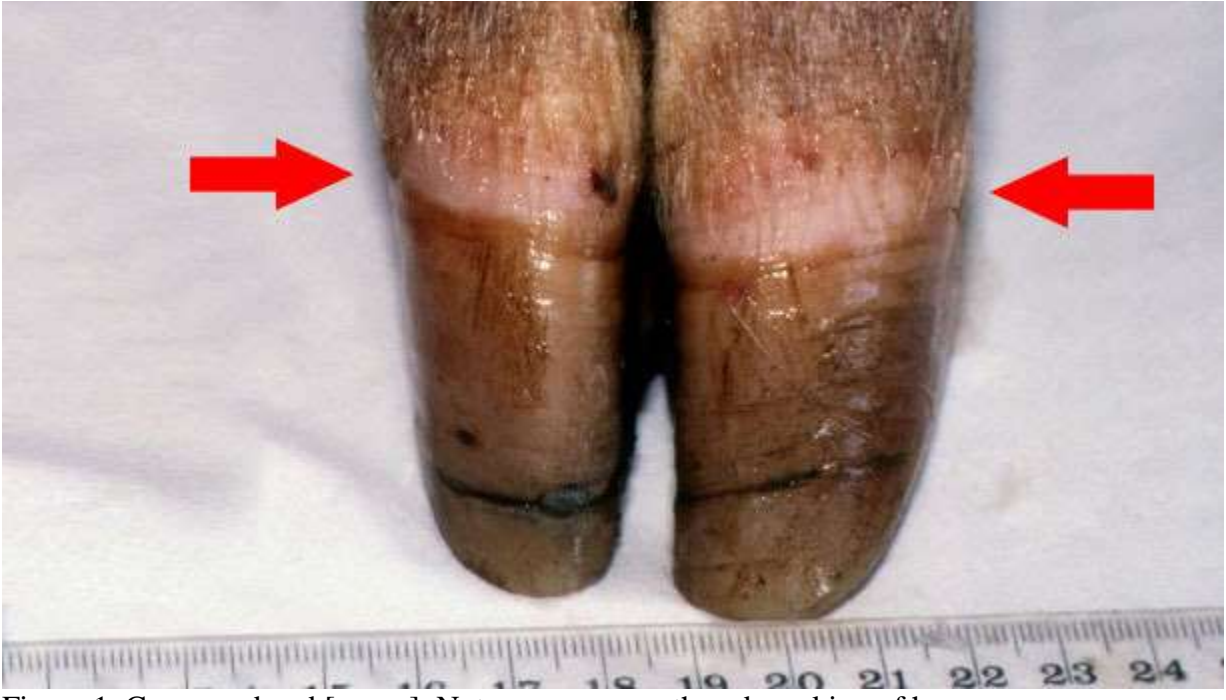
Figure 1. Coronary band [arrow]. Note uneven growth and cracking of horn.

Studies have shown that the wall of the hind limb claws grows approximately 50% quicker than that of the front limb claws, perhaps leading the view that overgrowth results from lack of wear. The growth of horn in the wall arises at the coronary band (Figure 1) and is progressively pushed down towards the weight bearing surface. Thus, any interruption or change to the coronary band or its function will impact on horn growth.