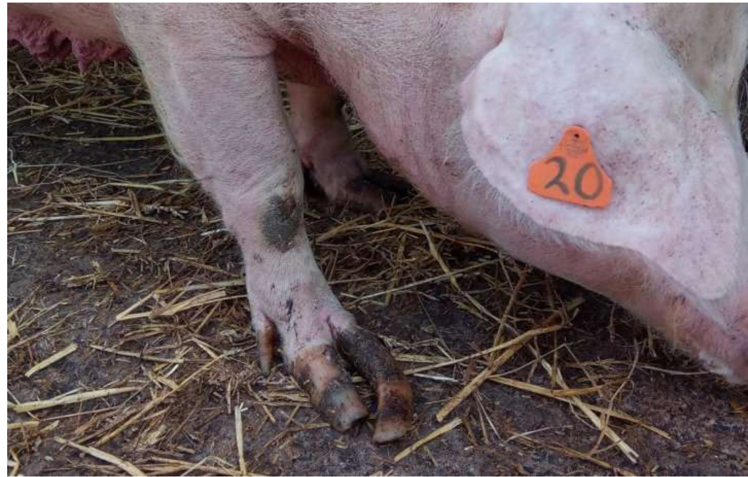
Figure 8. Slipper foot affecting front limb in loose house mature sow.

A 250 sow indoor breeder feeder farm with modest levels of productivity was found to have an increasing number of older sows developing "slipper feet" affecting both front and back legs. The problem had come to a head following culling of an affected sow and a report to government authorities on the grounds of welfare. The severest cases seen on farm are shown in Figures 8 and 9. In the former, clear cracking of the claws is evident.