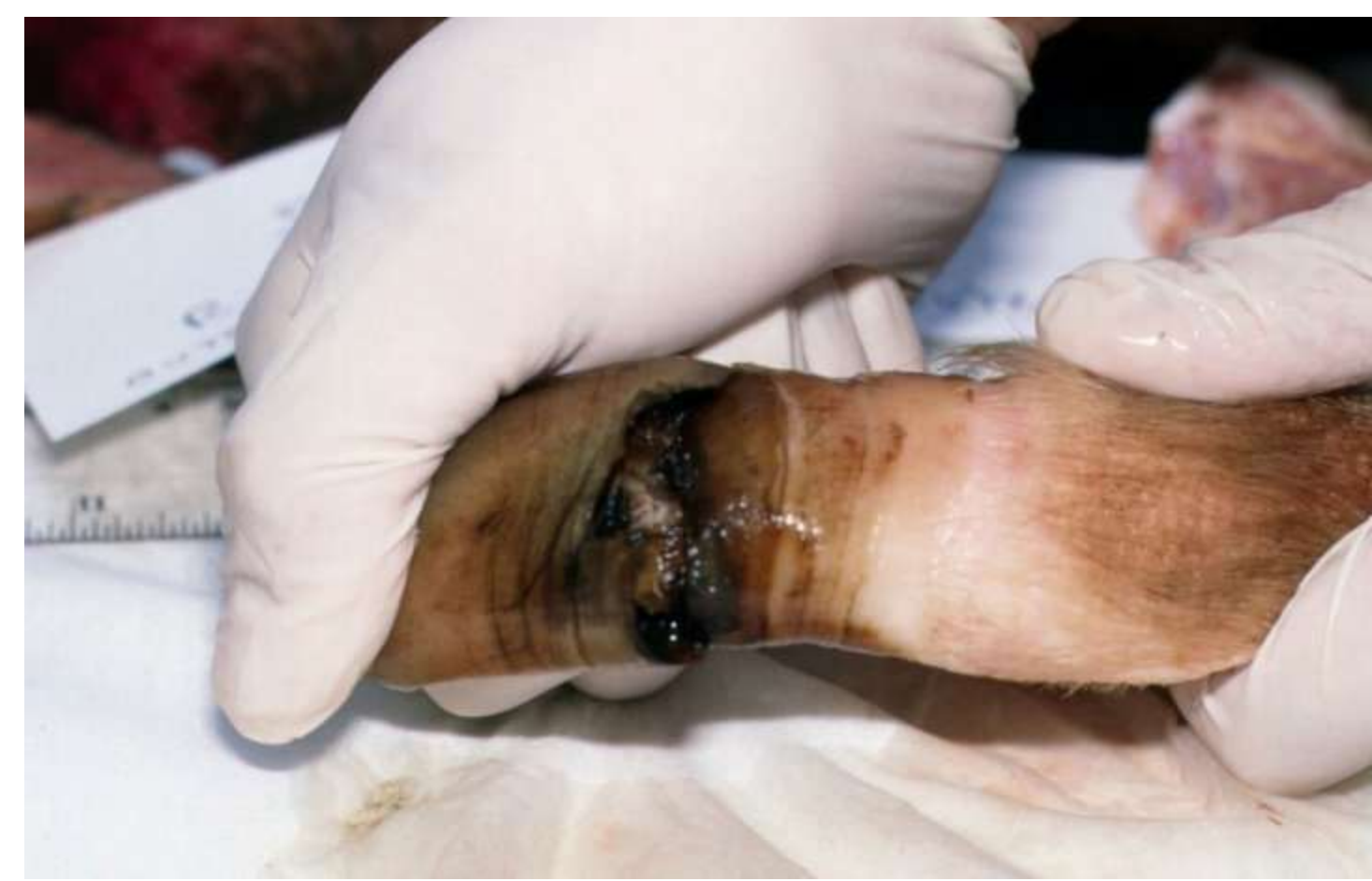
Figure 7. Separation of the distal part of the outer claw of the sow above with exposure of sensitive laminae underneath.

The herd had been set up on grass pasture land onto which the sows were placed in March. The grass was particularly lush and by September many sows were lame. Sows had been fed a lactator diets throughout their time on the farm. Some developed septic laminitis – the result of separation of horn and secondary bacterial disease. Forty-five second litter sows were culled due to foot lesions and a further 12 were euthanased on farm.