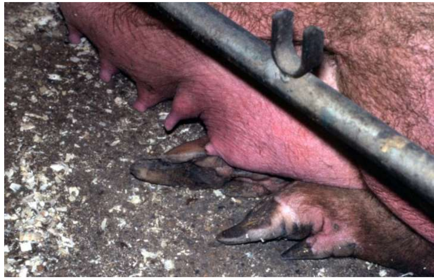
Figure 5. Early stage overgrowth of the outer hind claw.

Horn growth is highly dependent on nutrition – both macro and micronutrients. As a protein, its growth will depend upon correct levels and the balance of amino acids with sulphur-based cysteine and methionine particularly important. Many micronutrients play a role in horn growth and include zinc, vitamin D, biotin and selenium. Interruption to supply or surges in supply are likely to lead to erratic horn deposition at the coronary band and this will result in uneven horn and cracks (see Figures 1 and 6).