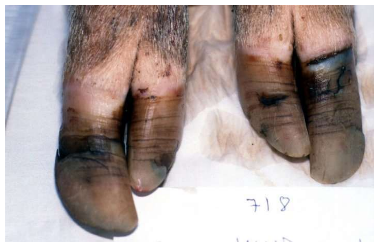
Figure 6. Hind feet of 2nd litter sow kept outdoors with excessive and uneven growth of claws with horizontal splitting.

In addition, the clinician should never forget the role vesicular diseases can play in affecting horn growth. If allowed to survive such a challenge the disruption to the coronary band will cause deformation of horn and in extreme cases "thimbling" – the complete shedding of the claw.