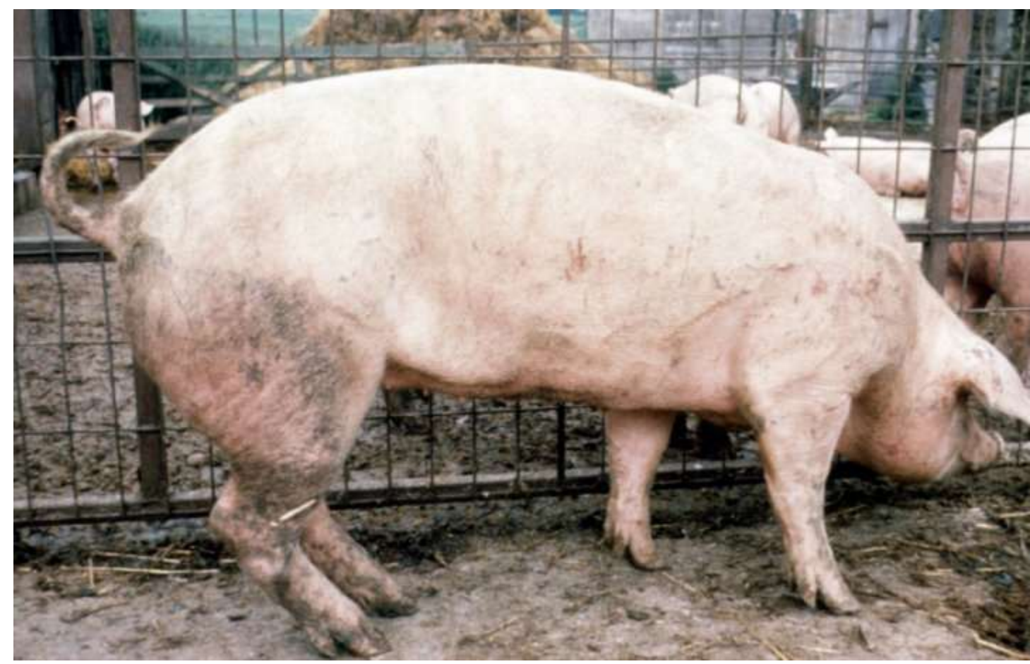
Figure 2. Upright front limbs; sloping back limbs in a sow.

Whilst conformation and stance of the sow will vary widely, the normal stance of the front limb is more upright (vertical) than the hind limbs (Figure 2). However, the latter is highly variable. As sows age the pasterns tend to drop, which alters the angle of contact of the foot with the floor. This may in part be associated with discomfort on certain floor types (Figures 3 and 4) or simply the result of tendon stretching under load. The sloping of the hind limb may of course reduce wear, allowing overgrowth of the front of the claw, especially the outer claw (Figure 5).