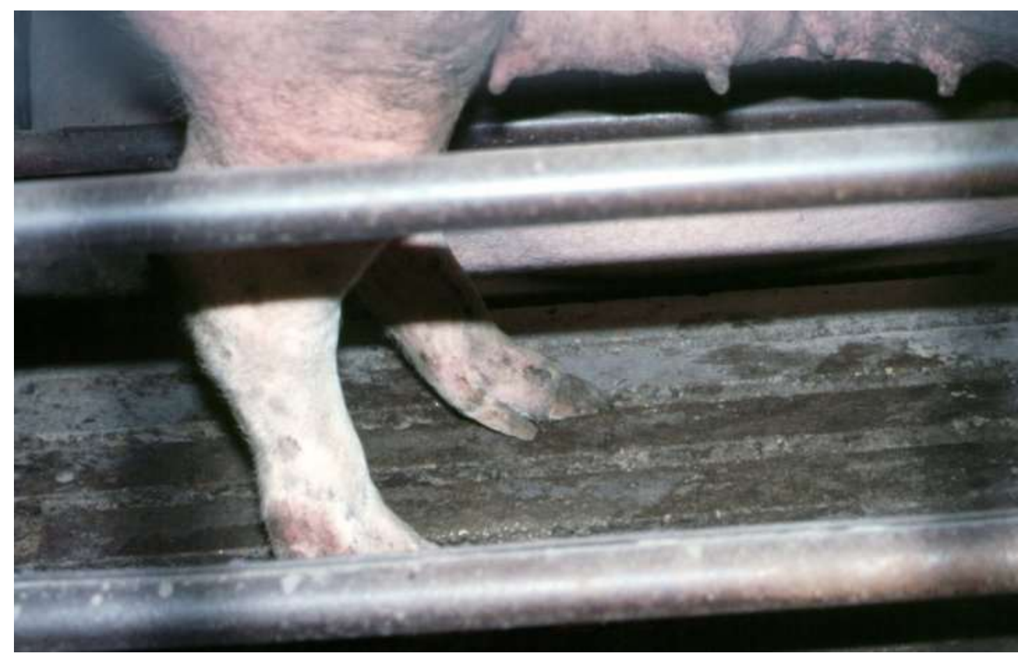
Figure 4. Dropped pasterns in the hind limb of a sow.