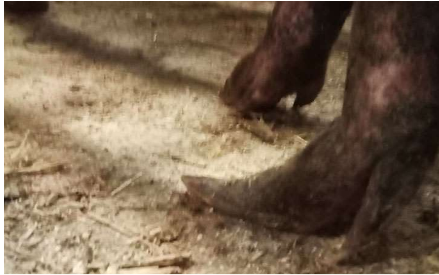
Figure 9. Slipper foot in the hind limb of a mature sow on the same farm as Fig 8. Note extended accessory claws as well.

The farm is entirely straw based with dry sows kept in small groups in kennels within a barn, with a scrape through dung passage. The herd has existed for 20 years with replacement gilts produced by a homebred criss-cross mating programme. The problem had not been seen or reported prior to early 2018.